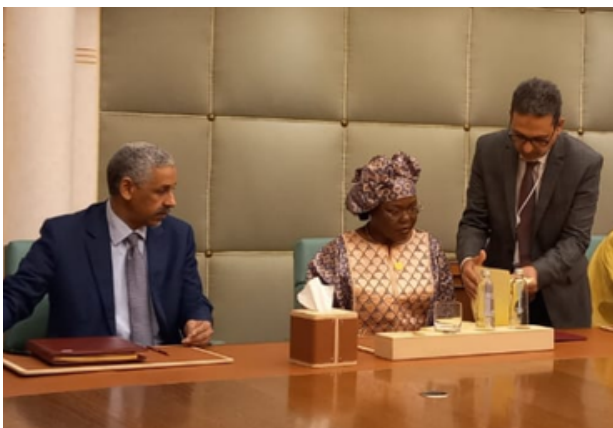
H.E. Niale Kaba, Minister of Planning and Development - Côte d'Ivoire