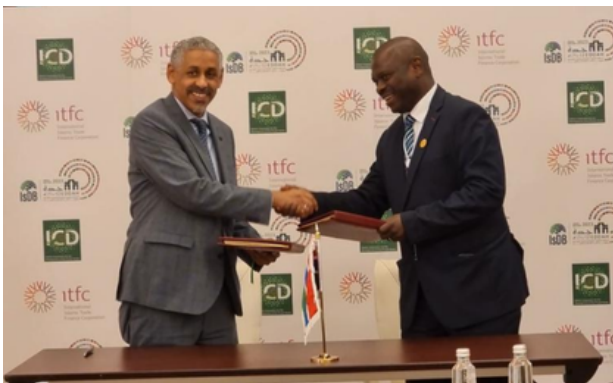
H.E. Seedy Keita, Minister of Finance & Economic Affairs - Gambia